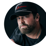
LEE BRICE American Country Music Singer & Songwriter