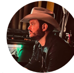
WADE BOWEN American Country Music Singer & Songwriter