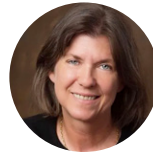
DR. JUDITH CURRY American Climatologist